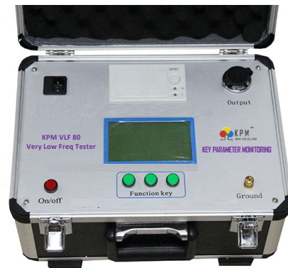
KPM – VLF Test Kit